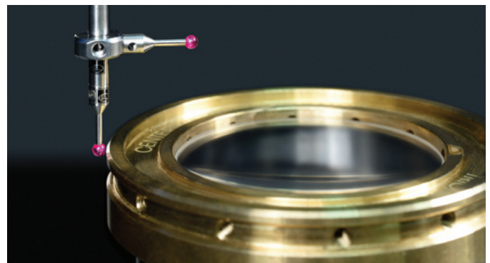
Unequaled repeatability and scalability result from integrated metrology in the ATS 200 alignment turning machine

Complete Optical Solutions: By bringing together expert system design, vertically integrated state-of-the-art manufacturing capabilities, and extensive optical metrology under one roof, we can take on projects at any level of design maturity, and quickly bring them to market.