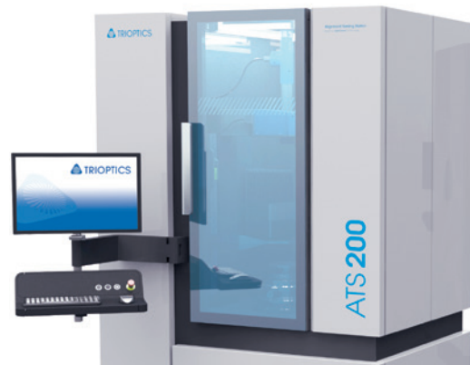
High capacity and precision is achieved with state-of-the-art alignment turning technology

Engineering Excellence: Through our innovation, in-depth know-how, and unique set of technical competencies, our designs represent the very best solution for each application. We design and accurately simulate "as-built" optomechanical imaging systems, including stray-light and FEA thermal and mechanical stress analyses. Coupled with advanced component-through-assembly fabrication experience and system-level thinking, this approach ensures that the end-product is fully optimized for manufacturability, cost, and performance, and can be directly transitioned to production.