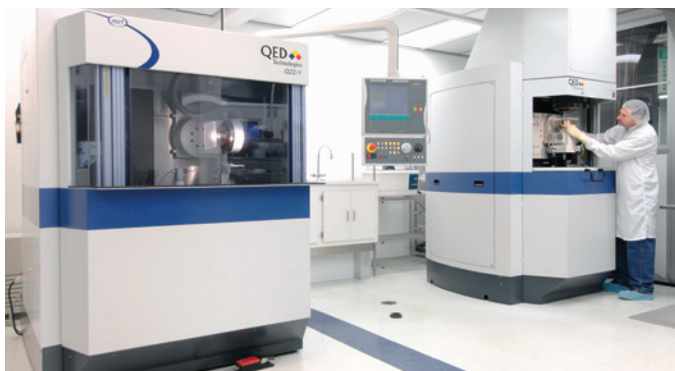
Superior wavefront capability with magneto-rheological finishing (MRF®)

Process: Whether you are developing a semiconductor metrology tool or life science imaging instrument, our engineers have extensive application-specific design expertise and work closely with your team to define the criteria that are most relevant for your application. The results are optimized trade-offs among competing specifications and balanced performance versus cost. We are recognized for our interactive and open design philosophy—we work intimately with our customers through every stage of the project, and provide full access to design details.