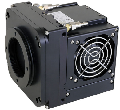
KL400 with Optional Liquid Cooling Connectors